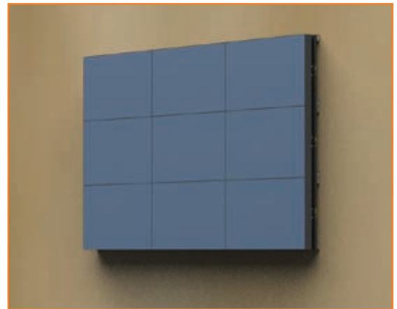
Example of a landscaped-oriented configuration.