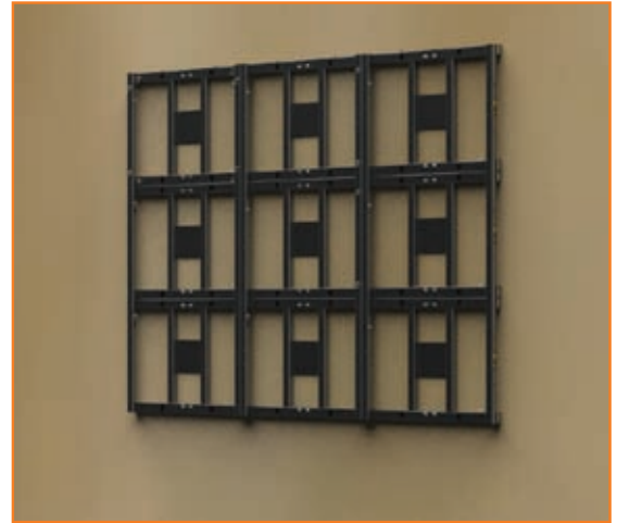
Install assembled frame work to a structural vertical surface.