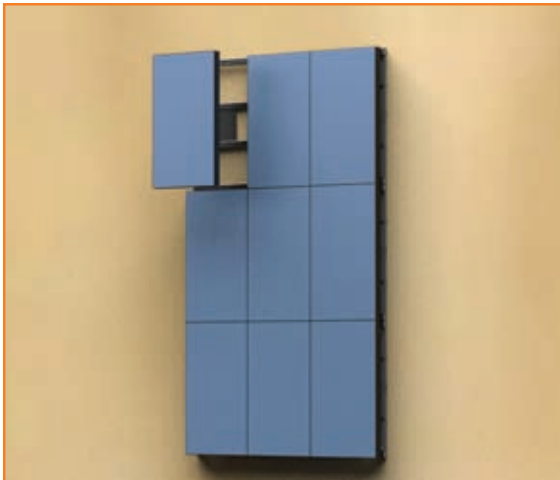
Example of a portrait-oriented configuration.