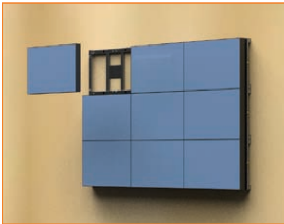
Load LCDs into frames starting at bottom right.